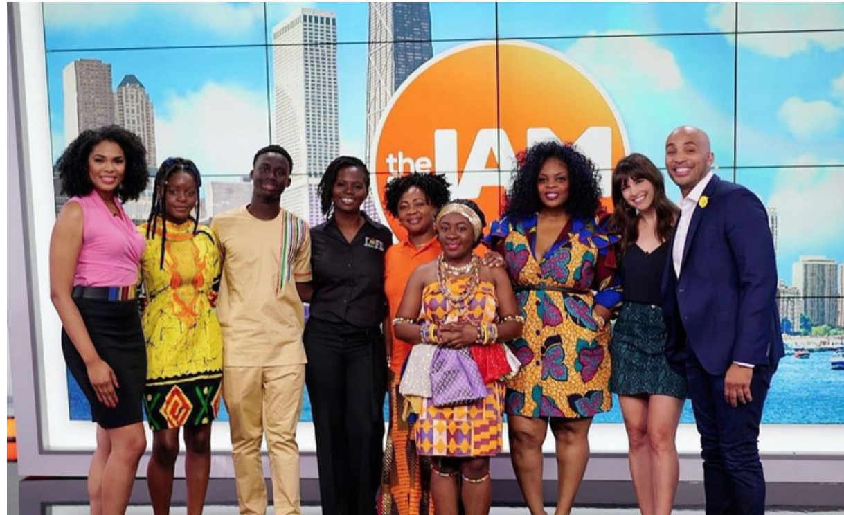
WCIU 26- THE JAM