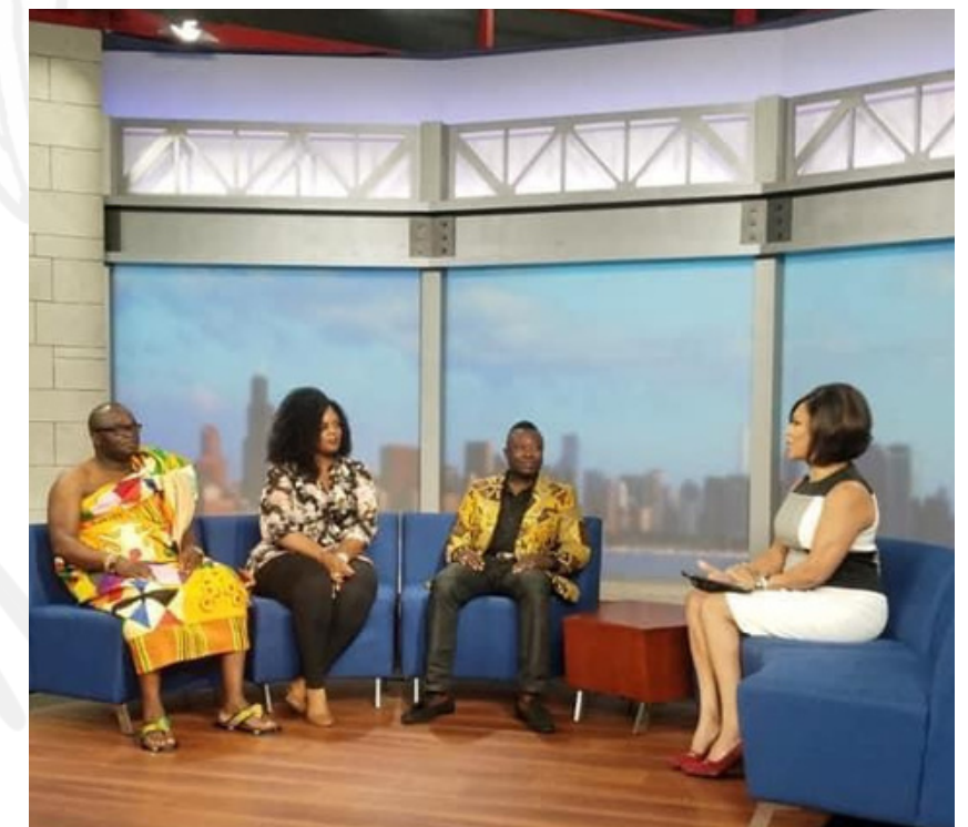
WGN 9 NEWS "PEOPLE TO PEOPLE"