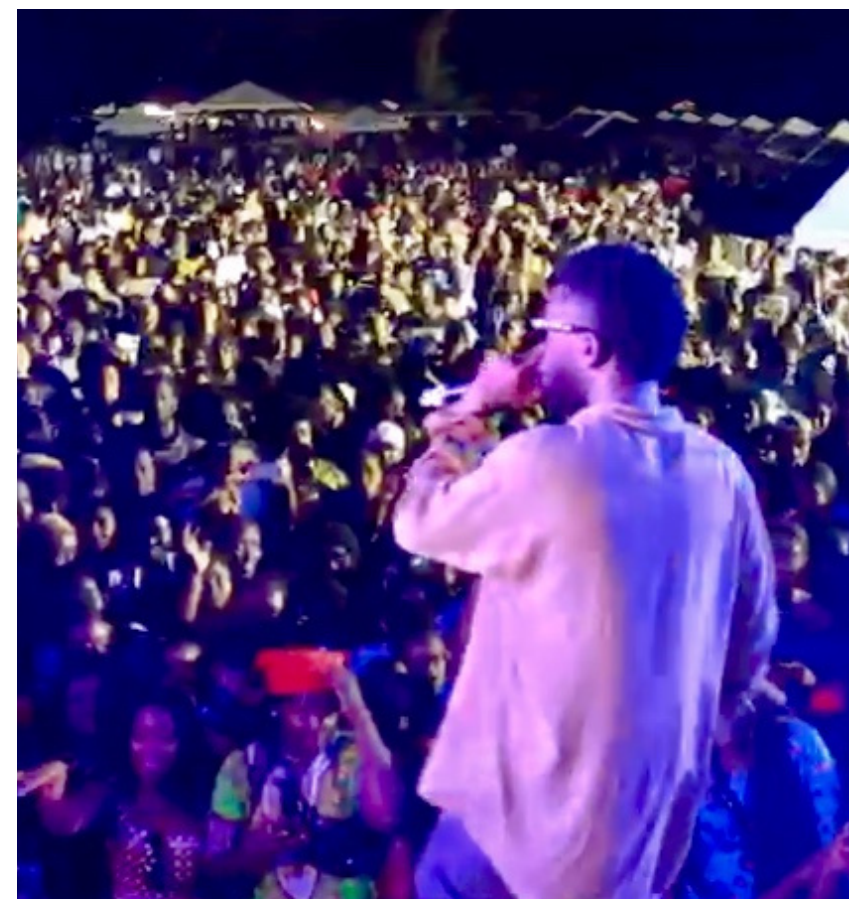
GHANAFEST® 2018 BISA KDEI