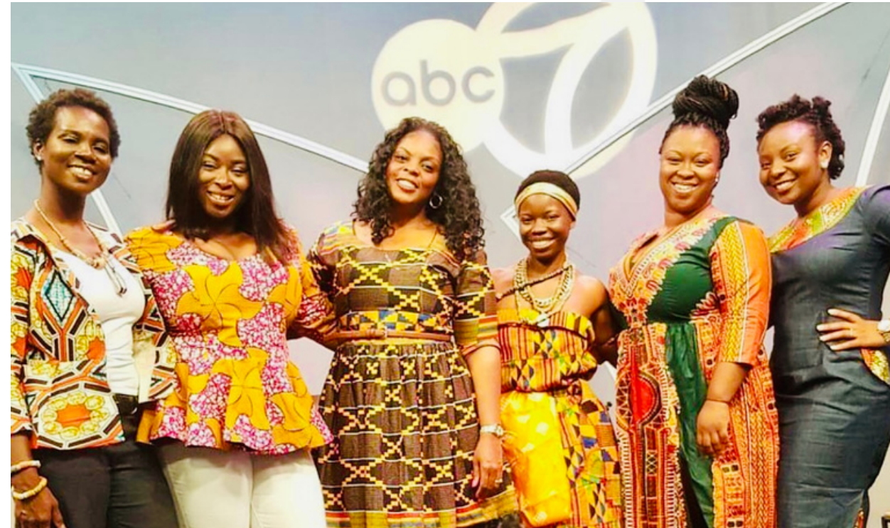
ABC 7 - MORNING NEWS